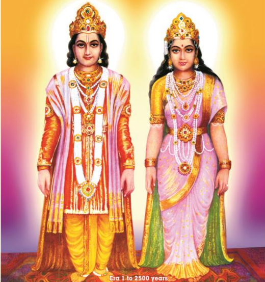
The Golden Age World Emperor Shri Narayan and World Empress Shri Lakshmi