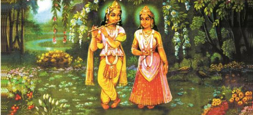
Crown prince Shri Krishna and Crown princess Shri Radhe before their swayamvar