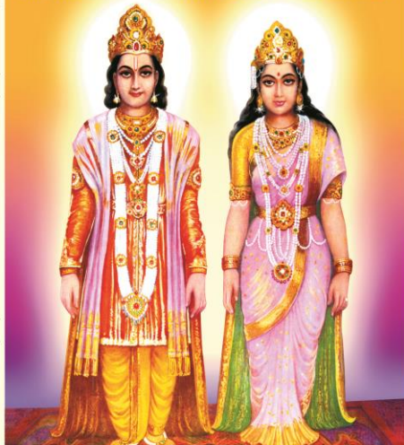
The Golden Age World Emperor Shri Narayan and World Empress Shri Lakshmi Crown prince Shri Krishna and Crown princess Shri Radhe before their swayamvar